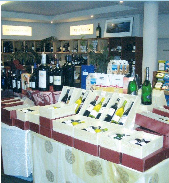
The Rouseu Kaapse Wijnen wine showroom

The monthly volume being moved can be divided into 70% sales into Belgium and 30% for export. Countries like France, The Netherlands, Lettland, Luxemburg and Malta are amongst the most important ones today.