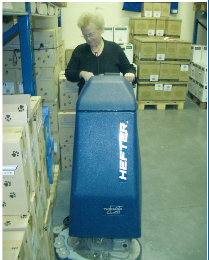
Cleaning close to edges - one of the strong features of TURNADO 55.